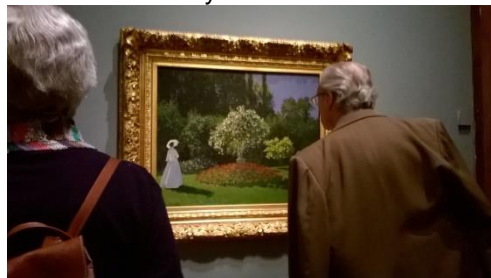
Friends of the Hermitage Foundation UK at Painting the Modern Garden: Monet to Matisse

There were private curator-led tours of Painting the Modern Garden: Monet to Matisse at the Royal Academy; Botticelli Reimagined at the Victoria & Albert Museum; Russia & The Arts: The Age of Tolstoy and Tchaikovsky at the National Portrait Gallery; Delacroix and the Rise of Modern Art at the National Gallery; In the Age of Giorgione at the Royal Academy; The Empress and the Gardener at Hampton Court Palace; Icons of Modern Art at the Fondation Louis Vuitton in Paris; and Abstract Expressionism at the Royal Academy. A reception for the book launch of Dynastic Rule: Mikhail Piotrovsky and the Hermitage by Geraldine Norman was organised at the Russian Ambassador's residence and attended by Professor Piotrovsky.